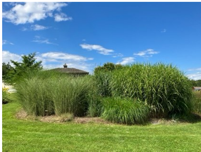
The original ornamental grass garden at the Demonstration Garden

Miscanthus grasses are natives of Southeast Asia. They are a common sight throughout Japan, Taiwan, and South Korea. Other species are native to southern Africa. Many varieties are found in gardens across the United States. The Demonstration Garden of the Rensselaer County Master Gardeners had an extensive display of grasses including Miscanthus in the centrally located Grass Garden. The Grass Garden was removed in autumn of 2023. It had matured over the years to a condition where grasses had surreptitiously spread amongst each other. In addition, the large specimens like Miscanthus had grown to the point where major division was necessary. Lastly, the invasive nature of Miscanthus was a factor in the decision to remove it. The magnitude of the task led to the decision to remove the garden and start anew. The size of the root systems required the use of an excavator to clear the site. Plans are underway to design a replacement garden for the site.