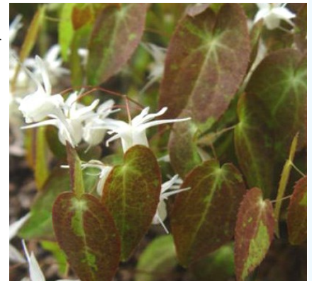
Epimedium 'Milk Chocolate'

Garden Vision offers the choice of the choicest, many being descendants of plants collected by plant explorer Darrell Probst in China, Japan and Korea that are absolute horticultural gems. I’d make room for Epimedium 'Flame Thrower,' with cherry red and creamy yellow blooms, 'Grape Fizz,' with grape-purple buds opening to blue-lavender flowers or 'Milk Chocolate,' with brown-purple leaves in spring and white flowers, and day. I’m intrigued by 'Mottled Madness,' with burgundy and green camouflage large leaves and the showy, red-bloomer 'Mars' in rosy-red. Epimediums make a welcome addition to any garden family.