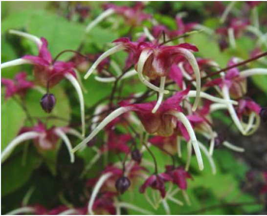
Epimedium 'Flame Thrower'