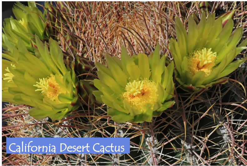
California Desert Cactus

I hope you'll enjoy the beauty we found in the desert, so different from our lush Northeast gardens, and follow the evolving bloom on their Facebook group.