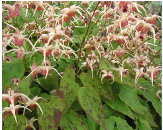
Above: Epimedium ‘Pink Champagne.’ Below: Epimedium \times youngianum .

Most flower in May and have a bloom composed of four inner sepals, a cup, and four spurs, somewhat like a columbine. Colors range from white and yellow through purple, orange, and red. Their foliage can be showy, especially in spring, when some have leaves with red edges, a purplish blush, or completely vivid hue. Some have good fall color, too. They’ll tolerate partial sun, but once established will grow in dry shade, the kind of environment that is anathema to many plants and feature which is one of their foremost virtues. In my garden, any plant even willing to give it a try in the parched, nutrient depleted zone beneath the oak or the maple gets a gold star.