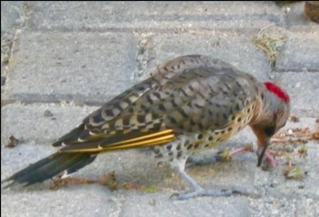
Northern Flicker returns every Spring to eat ants on the brick patio.