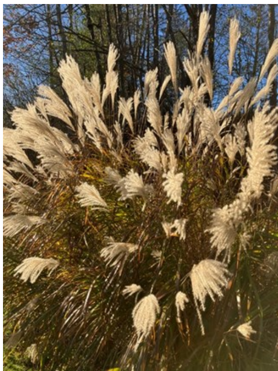
Miscanthus in winter

Miscanthus is being studied extensively for use as a source of biomass fuel. Research is being done at the University of Illinois, Cornell University and North Carolina State University. Europe and England have also conducted research. The primary object of the research is Miscanthus \times giganteus , a natural hybrid of Miscanthus sinensis and Miscanthus sacchariflorus . This seems to be the best biomass fuel or fiber source. It has even been crossed with sugar cane, a relative.